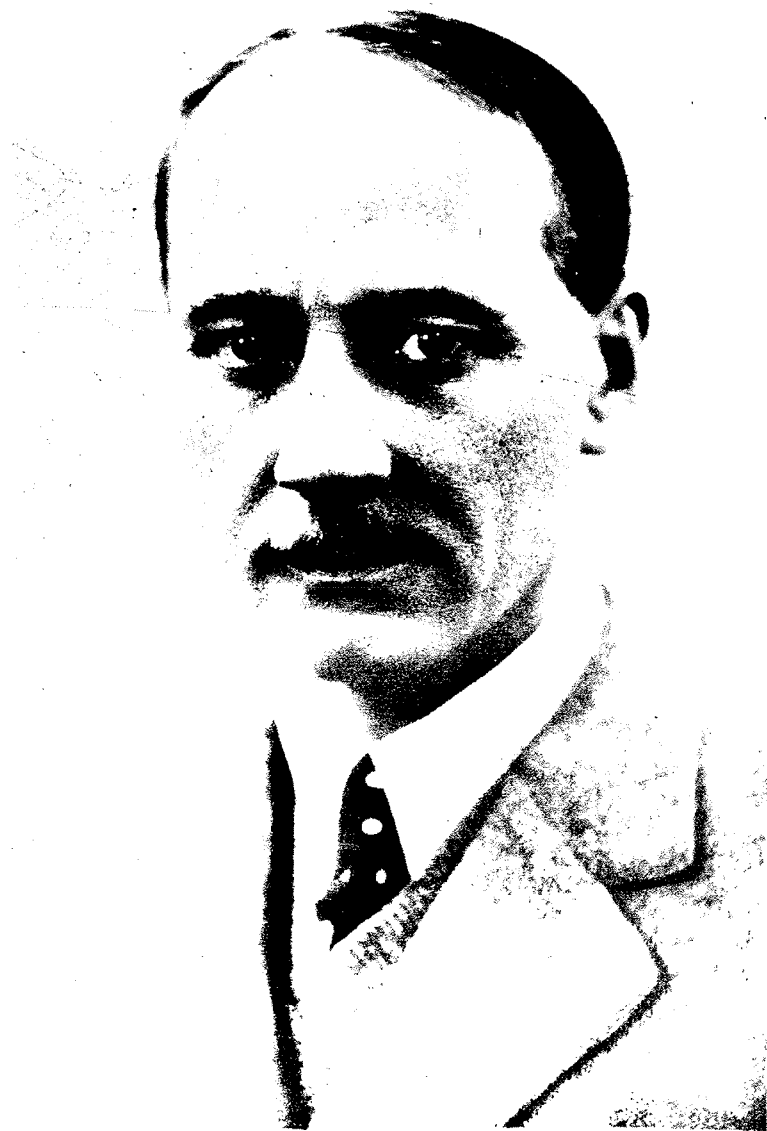
Mr. E. S. S. C. C.